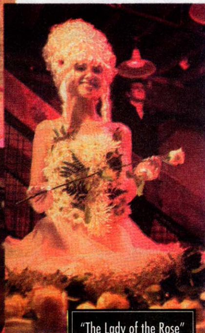
"The Lady of the Rose"