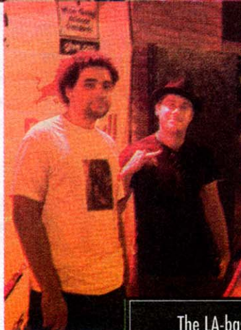
The LA-based Dynamite Brothers